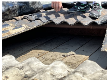
Collapsed roof - repaired, but whole roof needs replaced