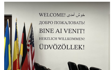
Each of these languages are spoken by someone in our church!