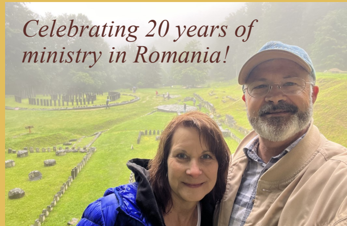
Celebrating 20 years of ministry in Romania!

Ukrainian VBS was held this month (July), which opened the door to minister to new families. Also we had our teen and Ukrainian camp weeks at Cozla cam. There were 5 teens saved and other decisions made that will last for eternity! In August we are holding our first Men and Boys campout. We are hoping that this will be a strengthening time for our men as well as a great time of fellowship!