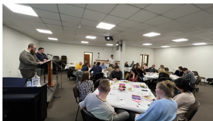
Married Couple's Dinner

Over 80 children in attendance at our last club of the year!